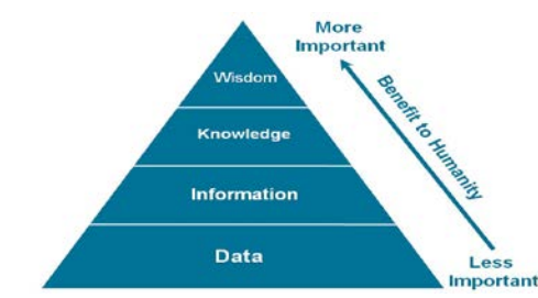
Fig (1) .Wisdom ,Knowledge ,Information, Data paradigm

These phases of the data improvement are demonstrated, by Fig (1) below.