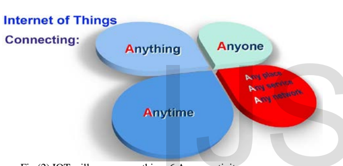
Fig (2) IOT will cover everything, 6 A connectivity

There are Different applications to be derived from the comprehensive vision of the definition as it described in the Fig(2),the 6A paradigm appears here (Anything, Anytime, Anyone, Anyplace, Any service, Any network )all of these factors will contribute with each other's [4].